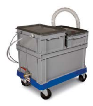
Sedimentation 60 L tank with pump controlled by the machine

Filtering / sedimentation 60 L tank, recirculation pump